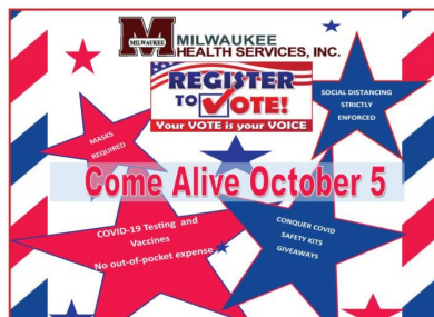
Come Alive October Five Encourages