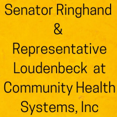
Senator Ringhand & Representative Loudenbeck at Community Health Systems, Inc