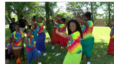
Safety a priority as Juneteenth Day Parade preps to return to in-person celebration, TMJ4