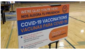
Bilingual COVID-19 pop-up vaccination clinic offered Saturday in Menasha, NBC26